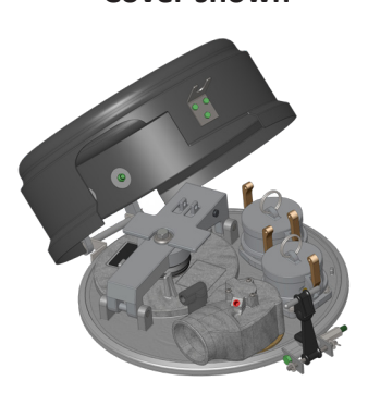
HWC451C shown on VOH451 series hatch