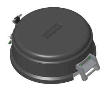
HWC451 Hatch Weather Cover shown