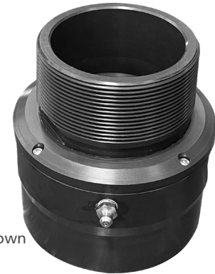
DBS080 Dry Bulk Swivel shown

Liquip's 3" Hot Air swivel has been custom engineered for use on dry bulk tankers. This lightweight swivel can be fitted between the hot air blower on the prime mover and the trailer liquification jet to remove torque forces on hoses transferring hot air. This swivel is not suitable for use with liquids.