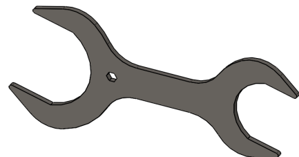
INSTALLATION TOOL (ORDER SEPARATELY)

METERS - VALVES - VENTS - MANHOLES - HOSEREELS - OVERFILL PROTECTION - LOADING ARMS - ELECTRONIC DIPSTICKS