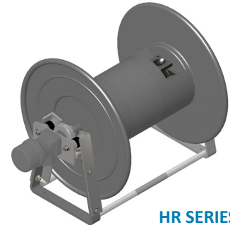
HR SERIES Hydraulic Rewind